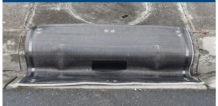
GuardDog Drain Filters can be installed in minutes to stop sediment, silt and oil from entering waterways.