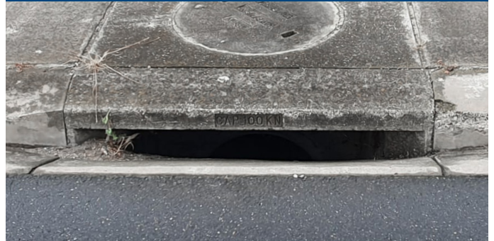
Protecting side entry drains from sediment, silt and oil can be challenging for any worksite.