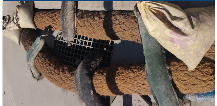
Coir logs and sandbags can offer some protection, but this setup can easily be compromised.