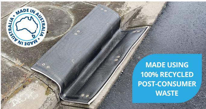
Contours to gutters for a perfect fit

Side-entry GuardDogs feature aluminium strips for a perfect fit on side drainage systems - simply mould to the gutter contour and then mount in place. Cleaning the GuardDog is easy too, just brush away any leaves or debris that builds up during use. Also can be reused for other work sites.